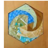
Iris Paper Folding by Cindy Sauve

This technique is a fabulous way to create beautiful decorative accents for the home, apply to clothing and accessories. The possibilities are endless. It's easy, it's fun, and you will be learning an almost lost folk art. Using scraps of wool or felt in rich colors, primitive shapes taken from nature, moons, stars and layers of circles (pennies) are appliquéd with a blanket stitch and embellished with simple embroidery. See additional supply list online at exeterfinecrafts.com .