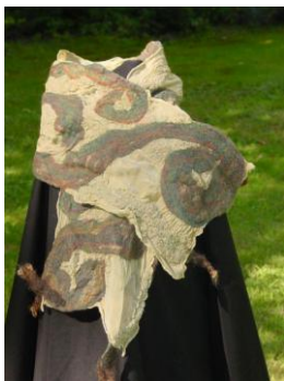
Nuno felting by Paula King

This class is for any experience level. You will learn about felting materials, techniques ("laminating" loose fibers to fabric, using wet felting techniques to form a new fabric) and a little folklore. Use Merino wool roving, other luxurious fibers, art yarns, wool curls, and organza silk fabric to create a decorative, lightweight art piece you can wear or hang proudly on your wall. Your finished work will be approximately 12" X 54". Bring 4 big towels with you. They will not be harmed.